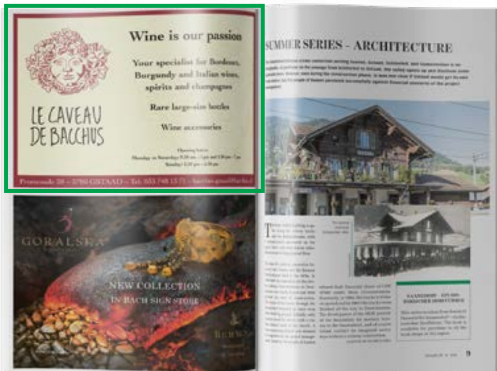
1/2 page (209 x 140 mm) CHF 1,400