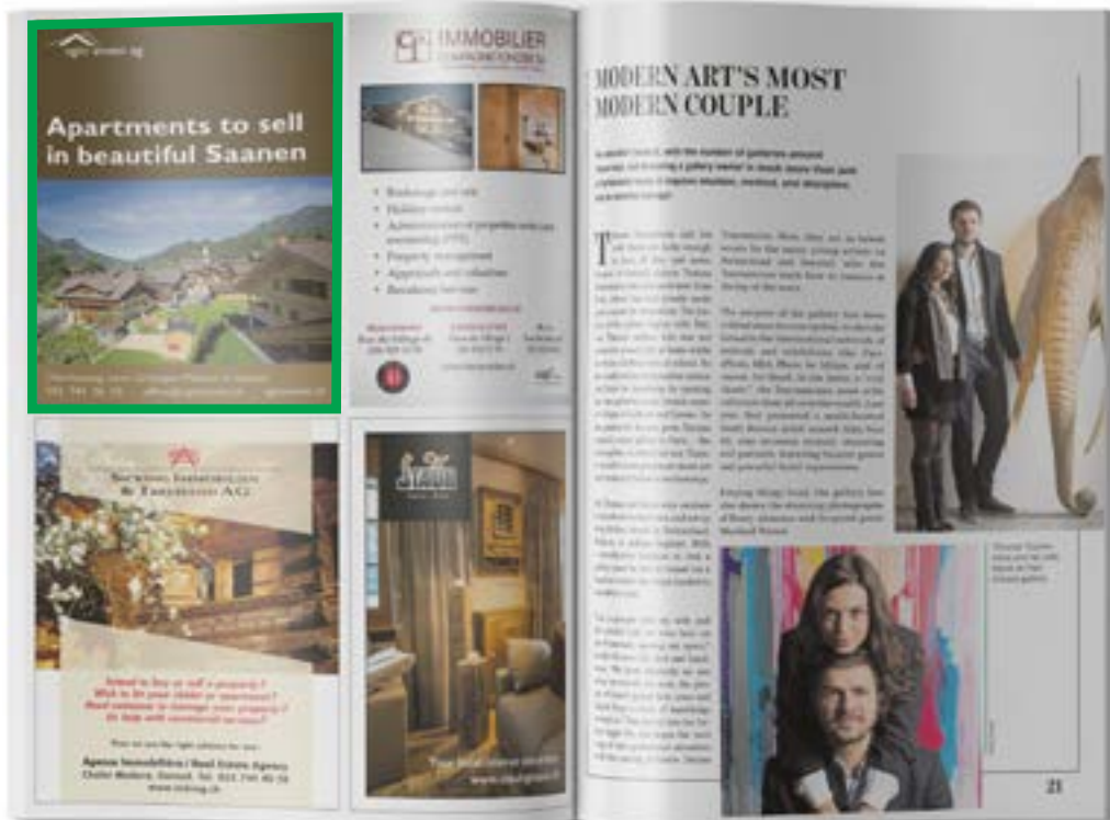
1/4 page (100 x 140 mm) CHF 750