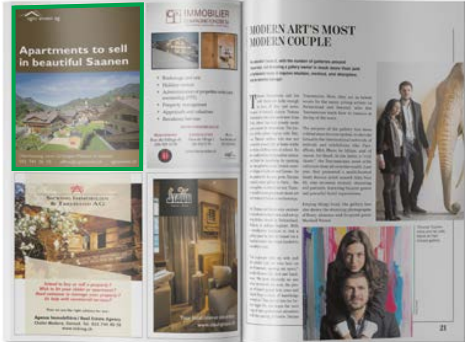
1/4 page (100 x 140 mm) CHF 750