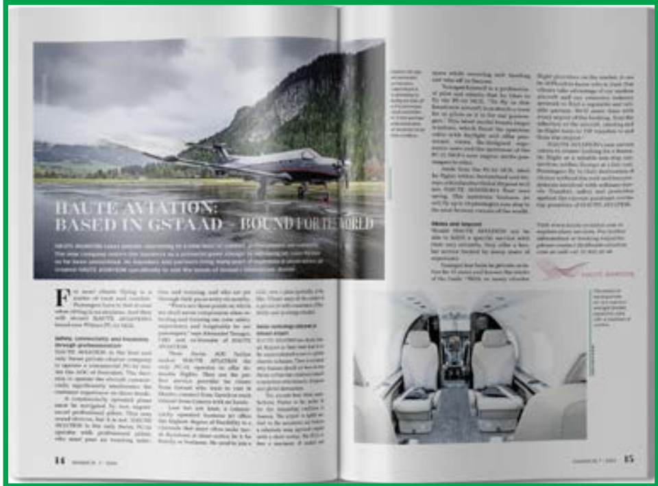
Double page CHF 2,600