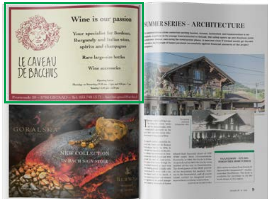
1/2 page (209 x 140 mm) CHF 1,400